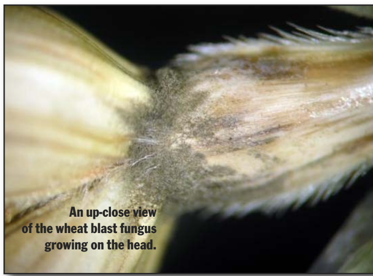
An up-close view of the wheat blast fungus growing on the head.

pected, and they do not see evidence of salmon or pinkish discoloration in diseased tissue, there is a good chance that it is wheat blast, said UK specialists.